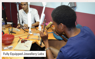
Fully Equipped Jewellery Labs