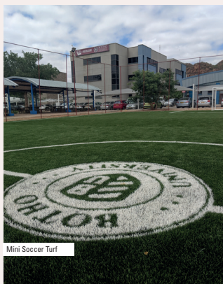
Mini Soccer Turf