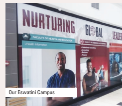
Our Eswatini Campus