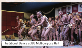
Traditional Dance at BU Multipurpose Hall