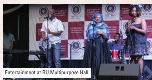
Entertainment at BU Multipurpose Hall