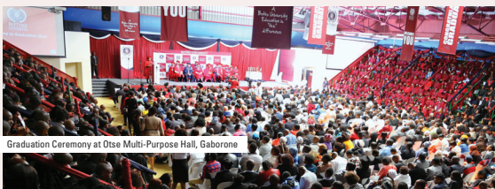
Graduation Ceremony at Otse Multi-Purpose Hall, Gaborone