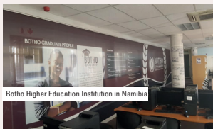
Botho Higher Education Institution in Namibia