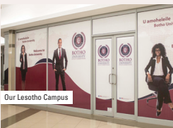
Our Lesotho Campus