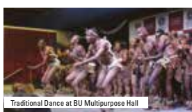
Traditional Dance at BU Multipurpose Hall