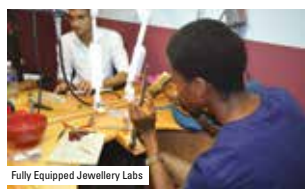
Fully Equipped Jewellery Labs