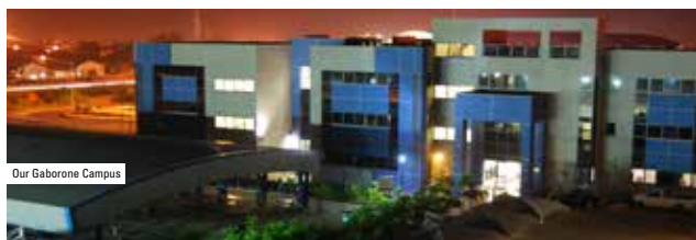
Our Gaborone Campus