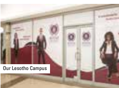
Our Lesotho Campus