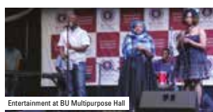
Entertainment at BU Multipurpose Hall