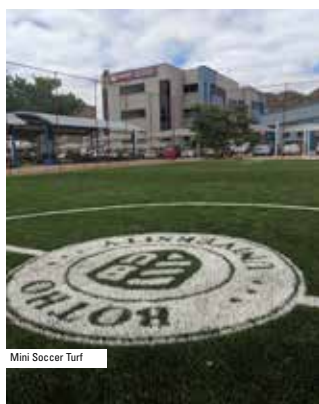
Mini Soccer Turf