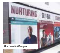
Our Eswatini Campus