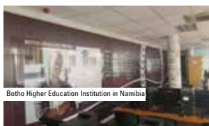
Botho Higher Education Institution in Namibia