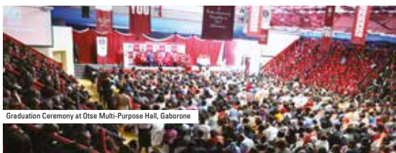
Graduation Ceremony at Otse Multi-Purpose Hall, Gaborone